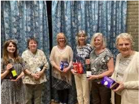
Congratulations to the Frodsham WI team 'Wonderful Women Team' who won the FCA Spring Quiz!

Our next quiz is on the 9<sup>th</sup> December.