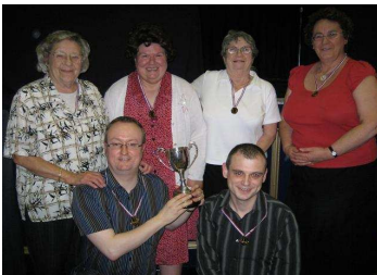
The Scrabblers. Winners of the September Quiz