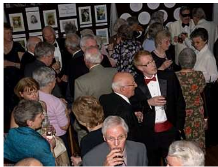
Guests assembled for the drinks reception before The Presidents Dinner.